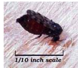
Adult female biting midge

Neither EHD nor bluetongue virus is spread by direct contact. Both are transmitted by tiny biting flies in the genus Culicoides . The best documented vector in North America is Culicoides variipennis , although other species of Culicoides probably transmit the viruses. These flies are commonly known as biting midges but also are called local names such as sand gnats, sand flies, no-see-ums, and punkies. Hemorrhagic disease characteristically occurs from mid-August through October, and this seasonality is related to the abundance of biting midges. The onset of freezing temperatures, which stops the midges, brings a sudden end to the outbreaks. How the viruses persist through the winter when midges are not active is not clear. Possibly, viruses could overwinter in a few surviving midges but it also is known that some ruminants can carry virus for several weeks.